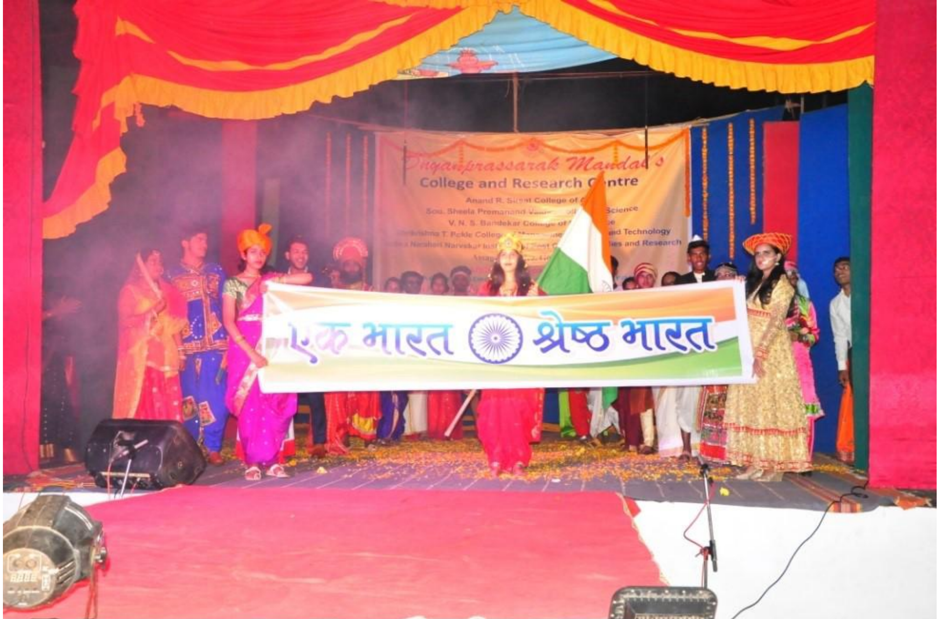
Fashion show with the theme of 'Ek Bharat Shreshta Bharat' at the Annual Day held on 21st December, 2019. Venue: College Campus, Dnyanprassarak Mandal's College and Research Centre.