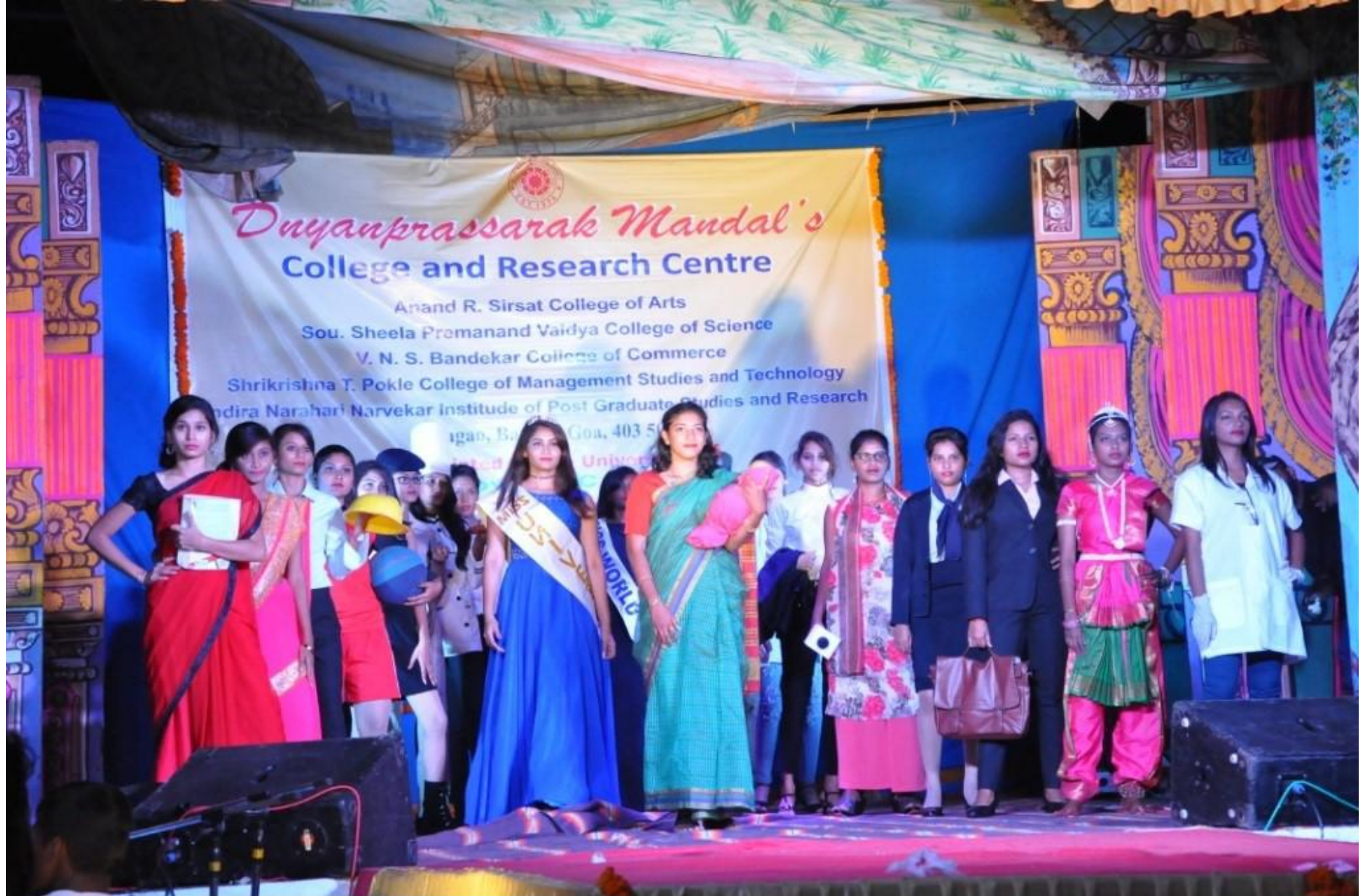
Fashion show with the theme of 'Women Empowerment' at the Annual Day held on 22nd December, 2017 Venue: College Campus, Dnyanprassarak Mandal's College and Research Centre.