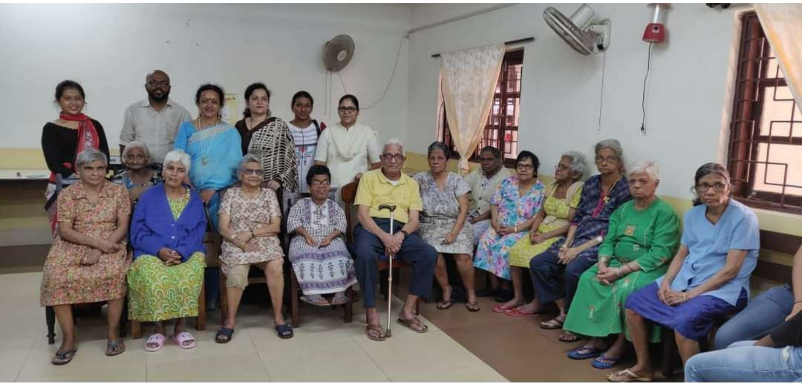
Celebrating 'Daan Utsav' at Sacred Heart of Jesus and Mary old age home, Aldona.