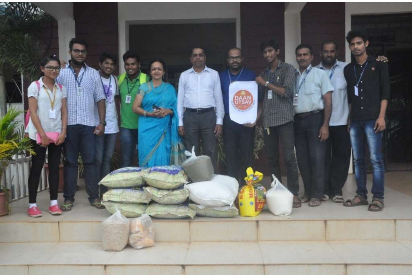
'Daan Utsav'-Joy of Giving at Dnyanprassarak Mandal's College and Research Centre.